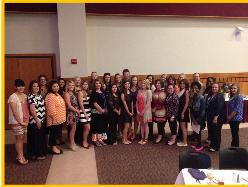
Thirty-one undergraduate and graduate students were initiated into the Mu Gamma Chapter of Kappa Delta Pi, International Honor Society in Education on October 28th, 2014.